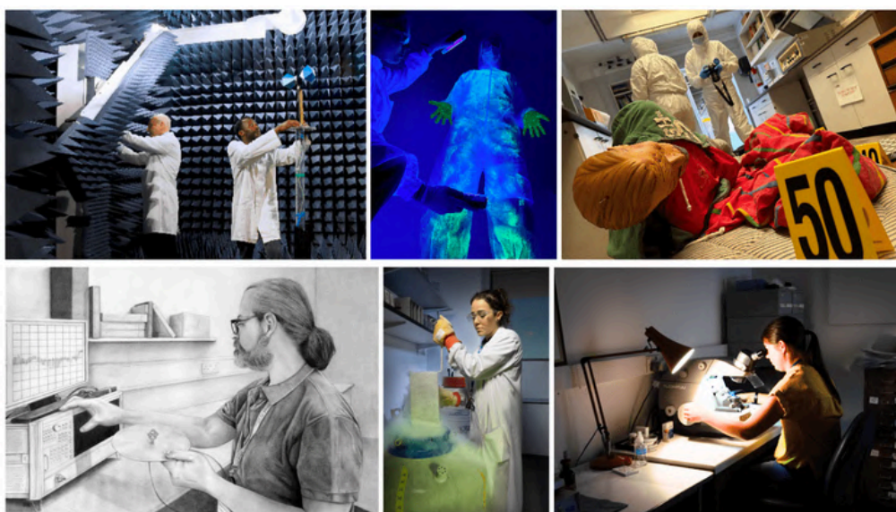
Examples of previous Conference winning images.

The image could be a photo, artistic depiction or hand drawn image. Under the Technicolour theme – an image bursting with colour, with you as the technician or your technical area at the heart of it.