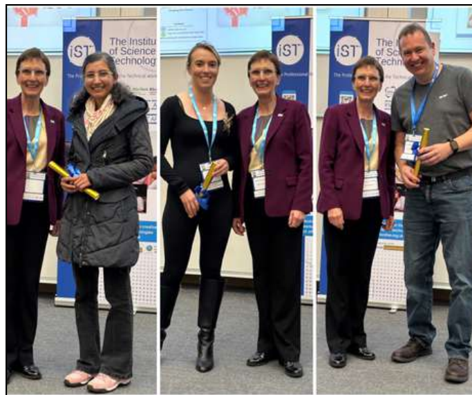
Figure 5: Helen Sharman awarded the 2025 prizes to the Poster competition winners.