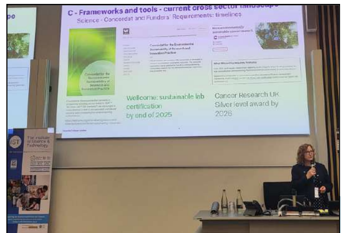
Figure 4: Workshops delivered throughout the Conference to inform and advance technical skills.;

Dr Raj Persaud closed the keynote programme in style, delivering laughs and life lessons in equal measure. Speaking from years of experience as a psychiatrist and life coach, he gave delegates practical tools to survive, and thrive, in high-pressure work environments. His anecdotes had the room in stitches, but behind the humour were serious lessons in resilience, wellbeing, and sustaining a fulfilling career as a technician, scientist, or researcher.