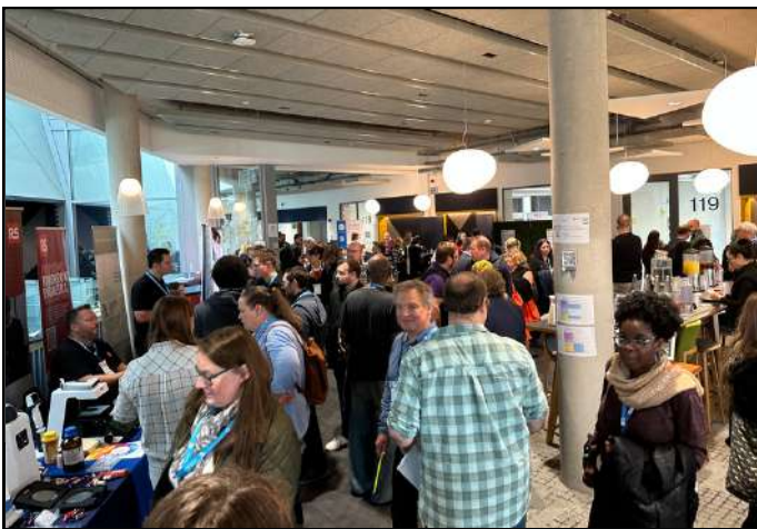
Figure 1: Delegates wandering around the Exhibitor Space.