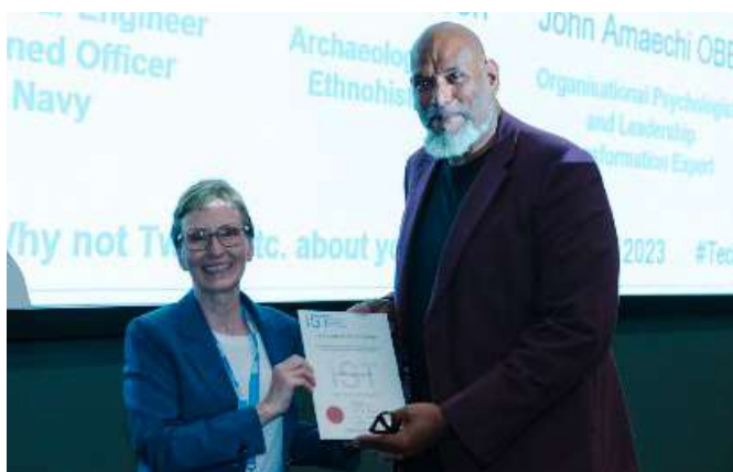
John Amaechi OBE, FIScT CSci