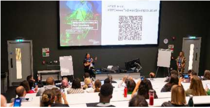
Photo insights from the day