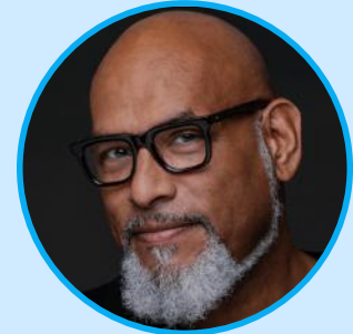
John Amaechi OBE, FIScT CSci

Organisational Psychologist, Author and Coach