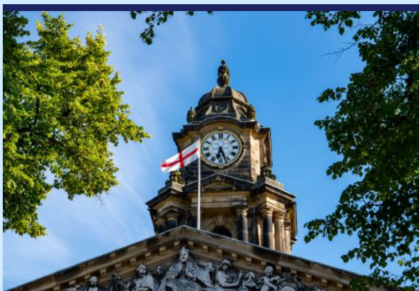
Lancaster City Council