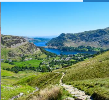
The Lake District