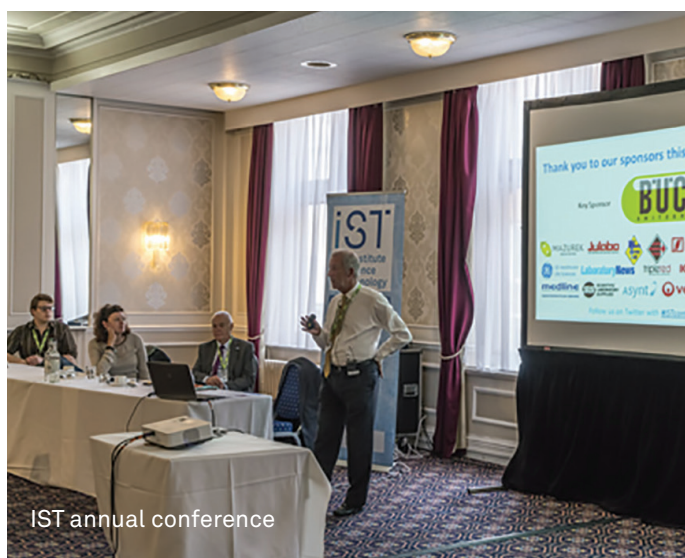
IST annual conference