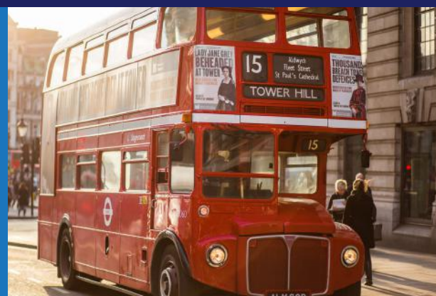
3 Vanguard Red Bus